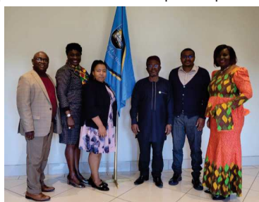
Staff of FLPS