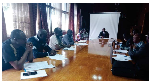
Preparatory meeting with some Principal Investigators and the DVC/RCB's Service

To ensure the smooth organization of the event, two preparatory meetings were held, attended by Principal Investigators and the Service of DVC/RCB to brainstorm on the possibilities of realizing maximum output at the conference. Consequently, the meeting recommended the invitation of seasoned researchers to give their experiences and expert knowledge on enhancing the capacity of emerging researchers.