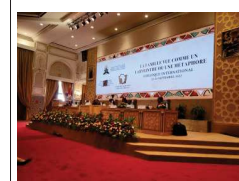
Conference hall at Rabat