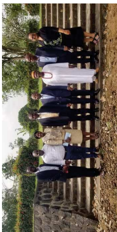
Project Team and UB TOP MGT after proclama- tion of grant award