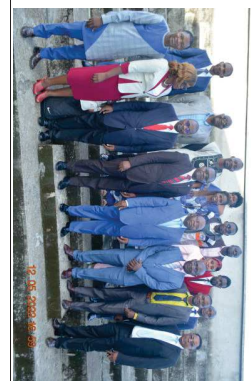
D-SINE Africa Project Team with VC at Project Launching