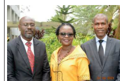
Staff of Cooperation Division

It is our wish that students and staff should make maximum use of the partnership agreements that are available. Meanwhile, the university is determined, more than ever before, to maintain the existing linkages and create new ones. Below is the summary table of the existing partnerships for exploitation.